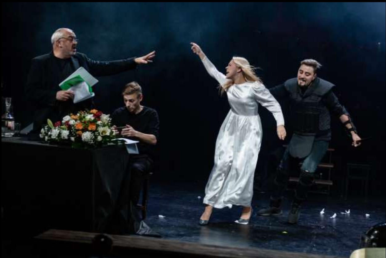
A scene from the reading at the Maly Theater, Vilnius, Lithuania.